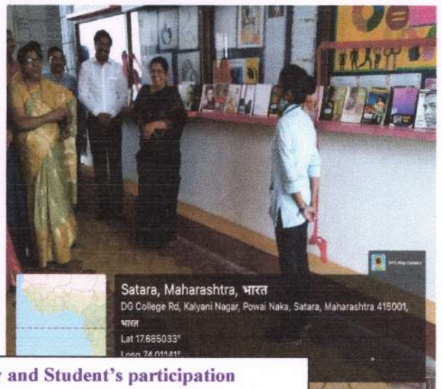
Dignitaries, Faculty and Student's participation